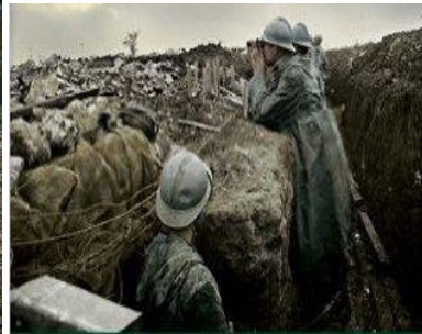
Preserved Trenches, St. Mihiel Salient

Due to the absence of handicap and disability laws in Europe, any tour participant with disabilities must be accompanied by a companion who is fully responsible for assisting the disabled tour member at all times throughout the tour. Our tour coach does not have wheelchair lift and staff is not permitted to offer physical assistance.