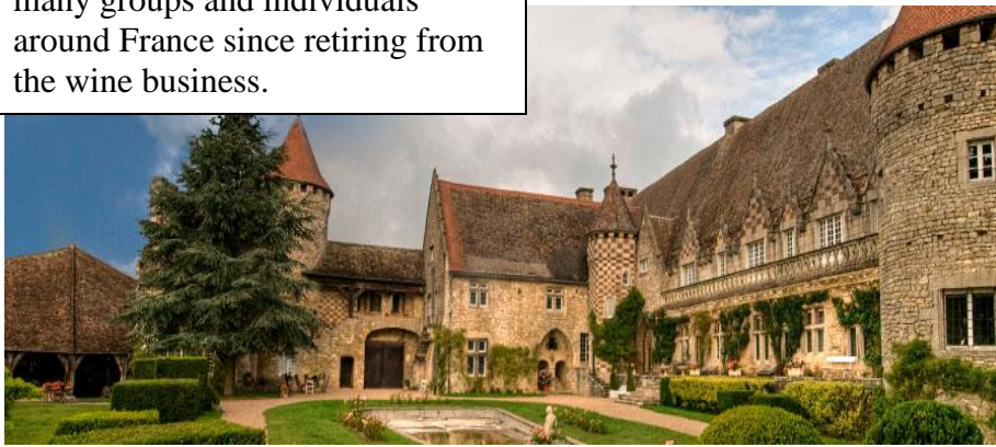
We will spend five nights at the Hattonchatel Chateau, outside of Verdun.